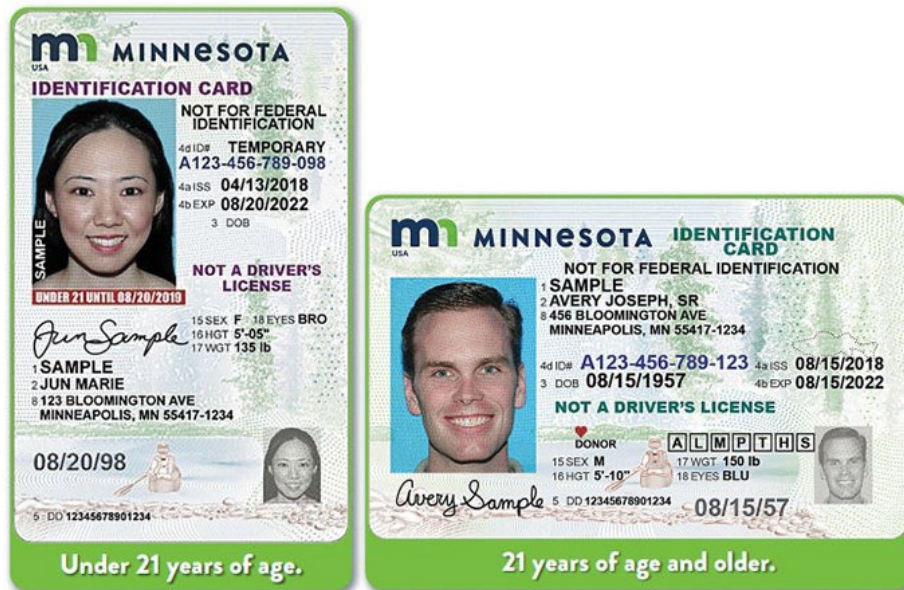
Daim ntawv Minnesota Identification Card

Muaj ob daim ntawv tsav tsheb nyob rau hauv xeev Minnesota: enhanced thiab Real ID. Yog tias koj xav tau daim enhanced los yog daim Real ID, koj yuav tsum muaj pov thawj qhia tias koj muaj ntawv nyob rau hauv Amelikas thiab koj yog pej xeeb Amelikas.